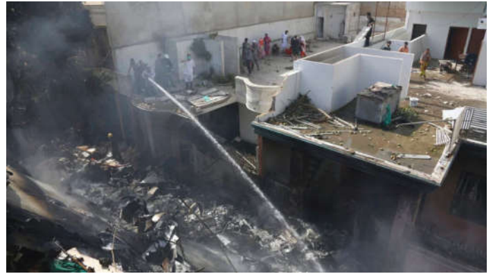
Mayor: Pakistan plane crashes near Karachi, all 107 killed