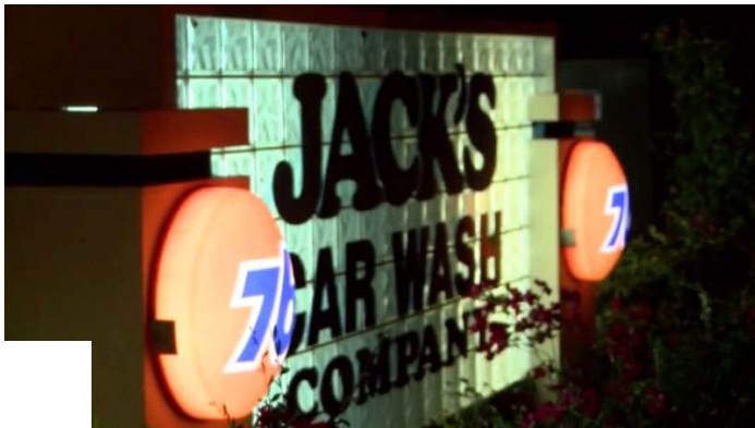
Businesses cited for opening during Fresno's shelter order should have fines forgiven, says councilmember