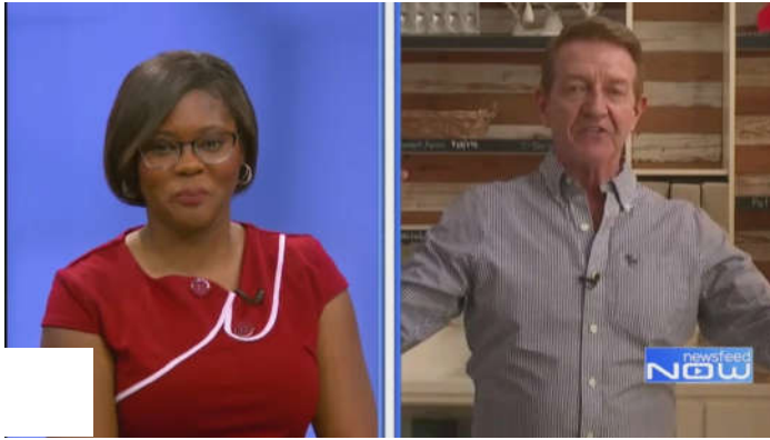
Newsfeed Now Coronavirus: 'Facts Not Fear' morning update – May 22, 2020