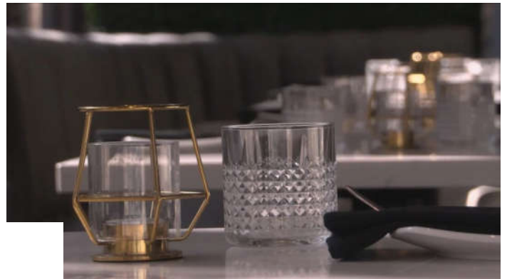
Fresno County restaurants getting ready to welcome diners back in